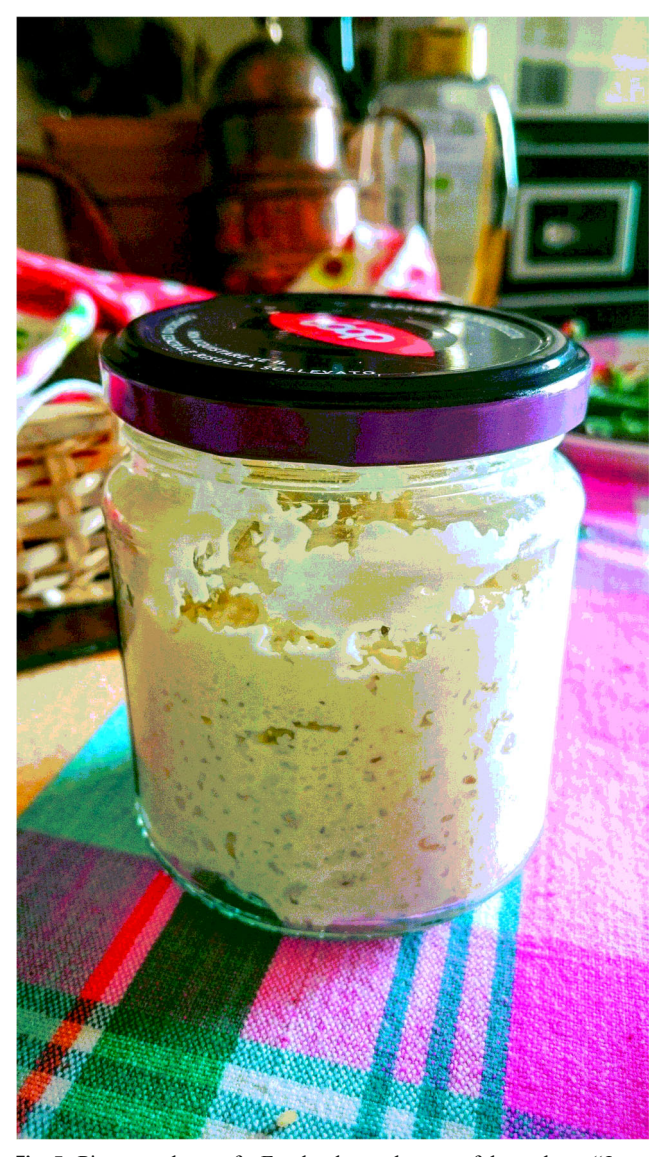
Fig. 5 Picture and text of a Facebook post by one of the authors: " I was created in California, where I contributed to the sustenance of my Creator with pizzas, wraps, pastries, croissants, bread, and turnovers. I died there four months later due to accidental causes. Earlier, however, a part of me had been given to another human being who, after a long journey through the Veneto, brought me back to my Creator, who was very surprised to find myself still alive. Now, I live in Trani, Italy. "

We might also regard this pandemic as an opportunity to rethink the capitalistic and globalized system on which our life is based. Maybe sourdough can help now but also be a practical example of how our world can be transformed into a sustainable system. Indeed, sourdough is at the cornerstone of a sustainable way of preparing food, aimed at selfproduction and social cooperation. It could indicate a new way of living that starts from daily activities, with a smallscale and bottom-up approach, based on sustainable use of