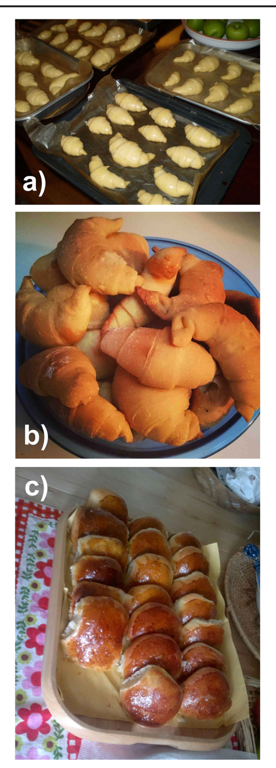
Fig. 4 Sweet dishes prepared with sourdough: a-b croissants, and b brioches

Currently, changes in consumer eating patterns have modified the perception of bread from a basic food toward nutritious and